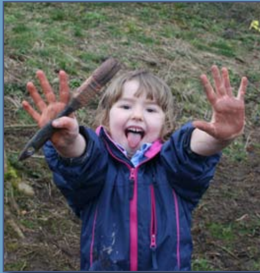
Dorset Forest Schools