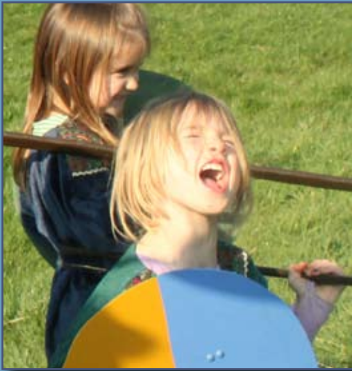
Treehouse Theatre | Storybox